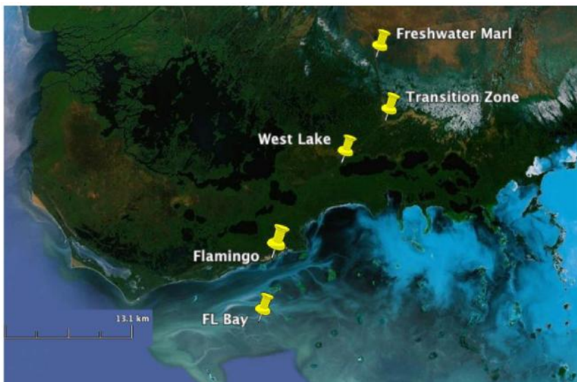
Figure 1. Projected coring sites corresponding to the GPS locations in the designated zones within the Everglades marl system.